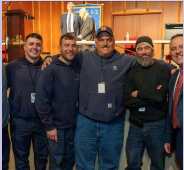
Local 1-2 Brotherhood