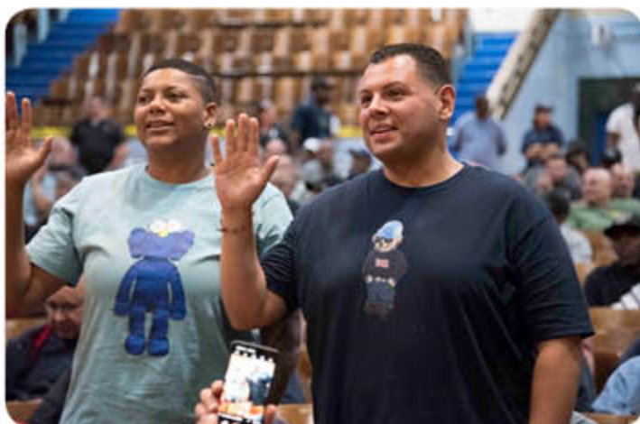
New Sister and Brother Members Get Sworn In