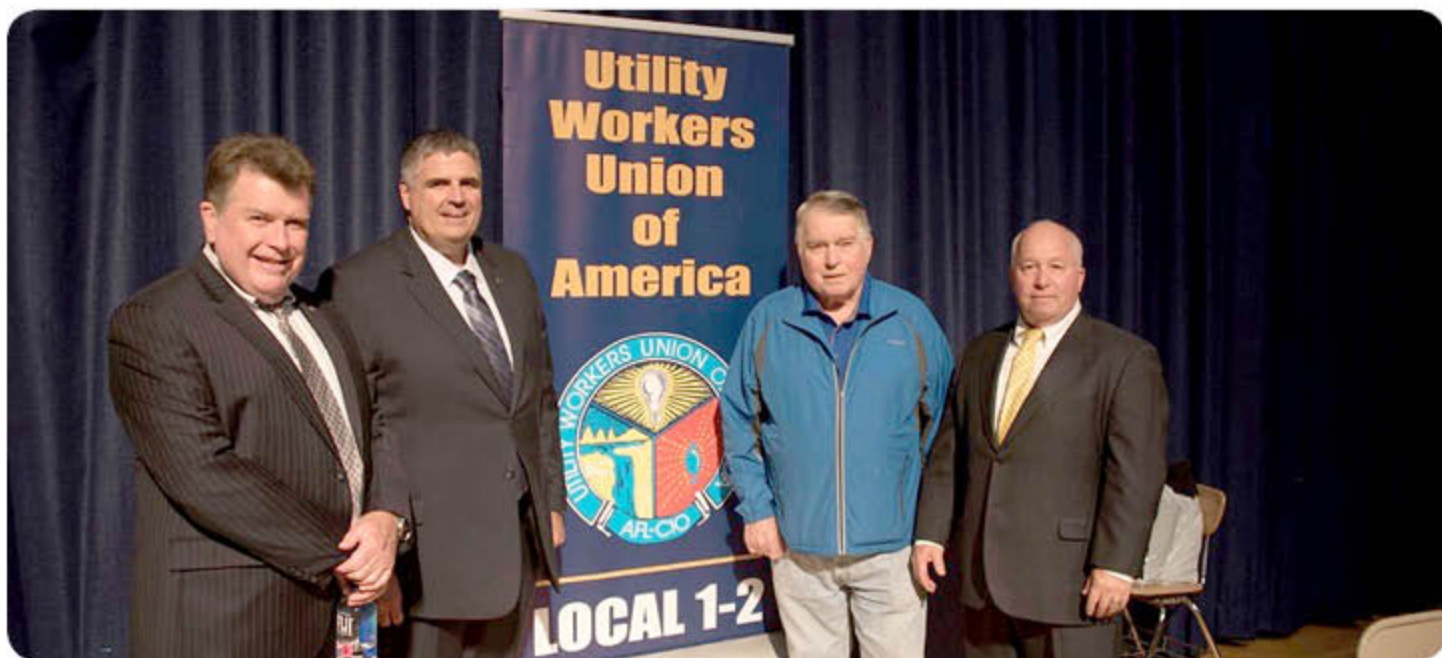
PRESIDENTS, VICE PRESIDENTS PAST AND PRESENT